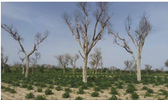
FIGURE 2: Dead trees of F. albida in a cowpea field in the commune of Kiéché.

According to the perceptions mentioned by the local communities in our study area, there are three main causes of mortality of F. albida : defoliating caterpillars, the larvae of beetles that were found in the trunks of dead trees, and rising groundwater. These causes are easily compared with those evoked in the spiral of [26, 38] which gives a general theoretical framework where all the plausible causes have been evoked with complex links